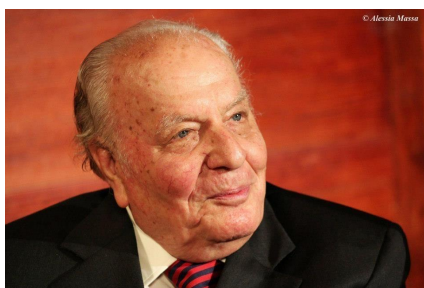
Professor Joseph Tusiani Fellowship