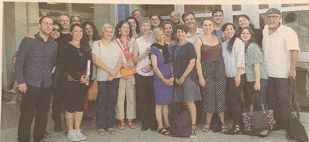
Seminario Il gruppo di studiosi che si è riunito nelle aule della Scuola di Lettere, Filosofia e Lingue