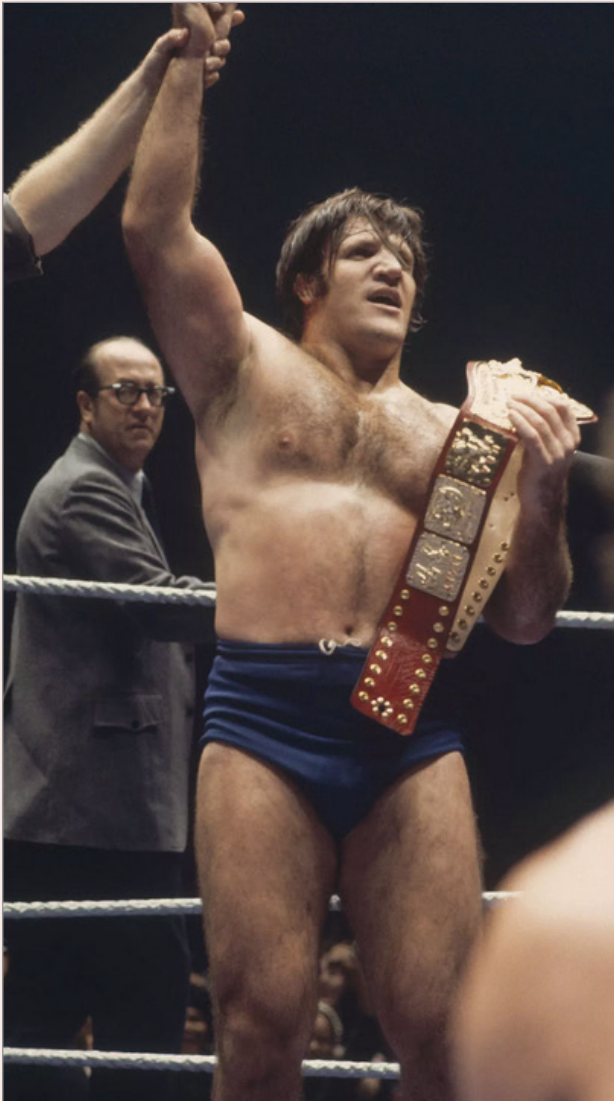
Bruno Sammartino at Madison Square Garden

BasilicatĒ is a research project to document Lucanian culture worldwide. The project is developed in collaboration with the Lucanian communities in New York City, Buenos Aires, and Montevideo. The final result will include: an international exhibition held in four different locations, workshops, activities for Lucanians abroad, conferences, and an in-depth publication. BasilicatĒ is made possible by the Federazione delle Associazioni e dei Circoli dei Lucani in Piedmonte, thanks to the support of the Basilicata Region, the coordination of the Centro dei Lucani nel Mondo Nino Calice, and the artistic direction of the Architecture of Shame group. lucaninelmondo.org