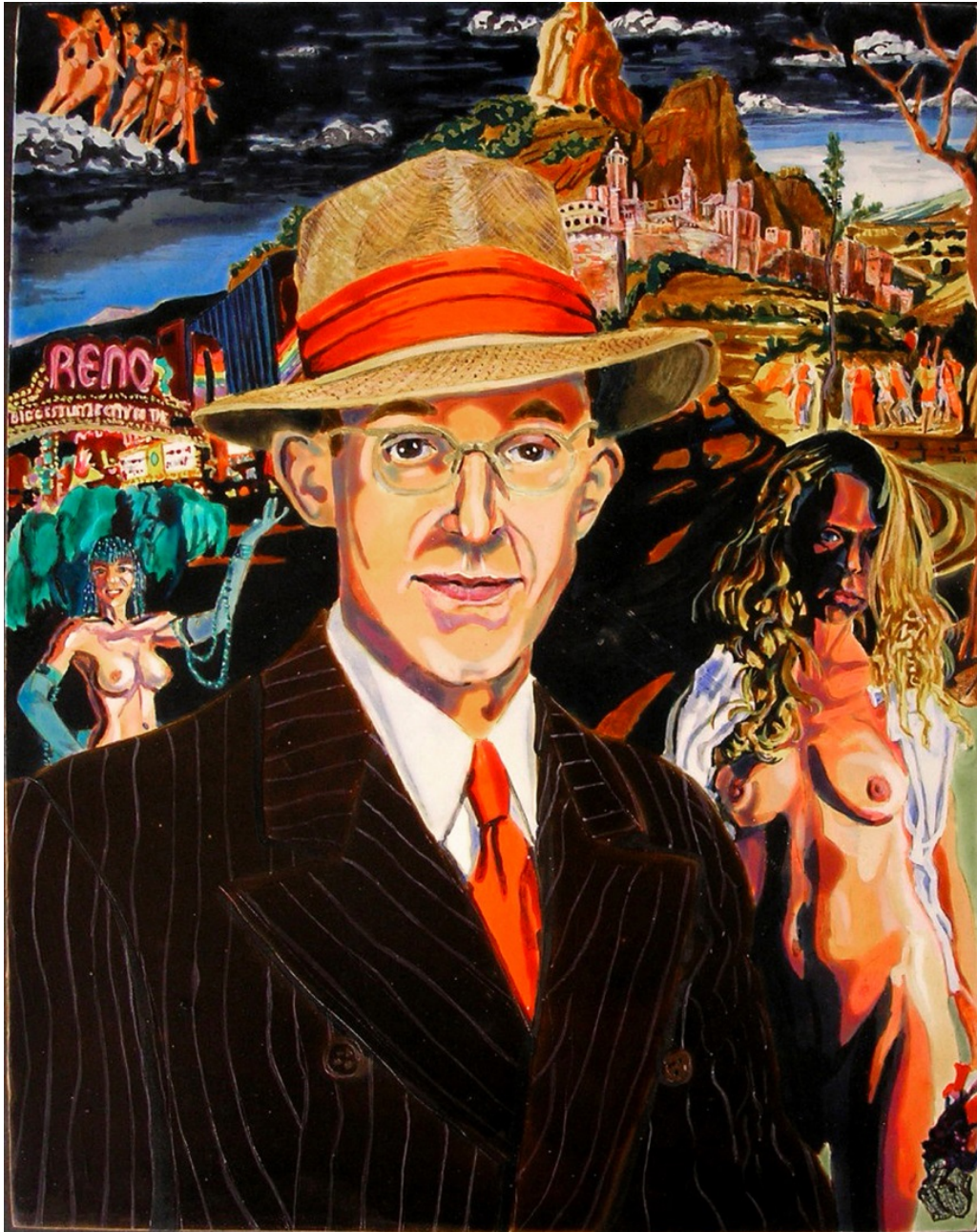
Cosmo Barone in Paradise egg tempera, 2007, 14 x11 inches