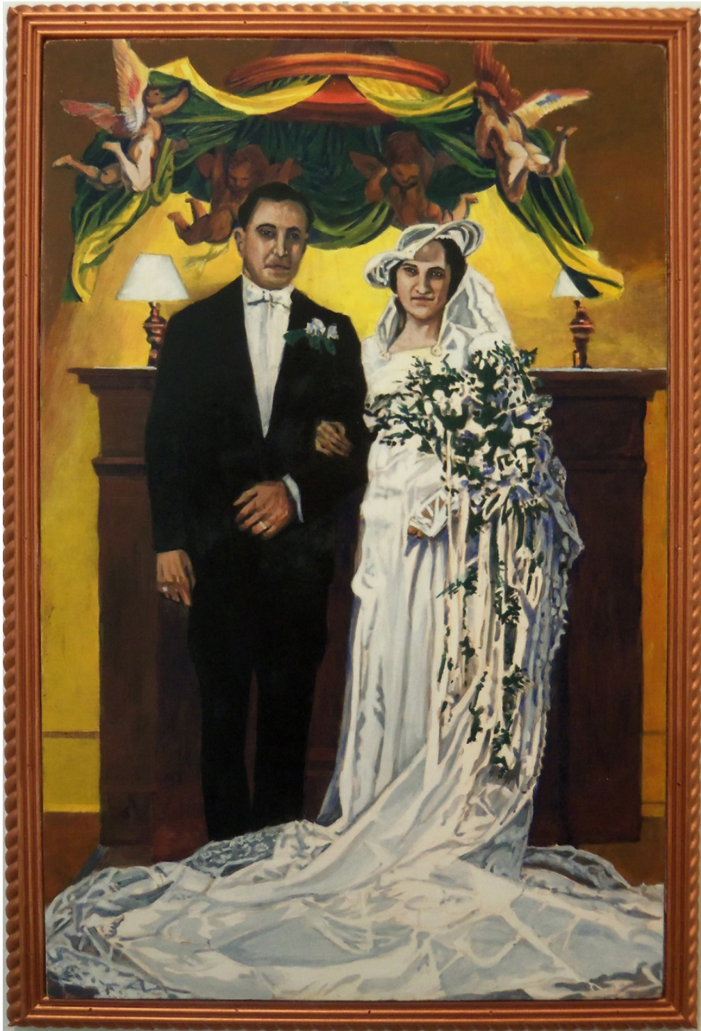
The Nuptials of Ross and Ida egg tempera, 2012, 24 x16 inches