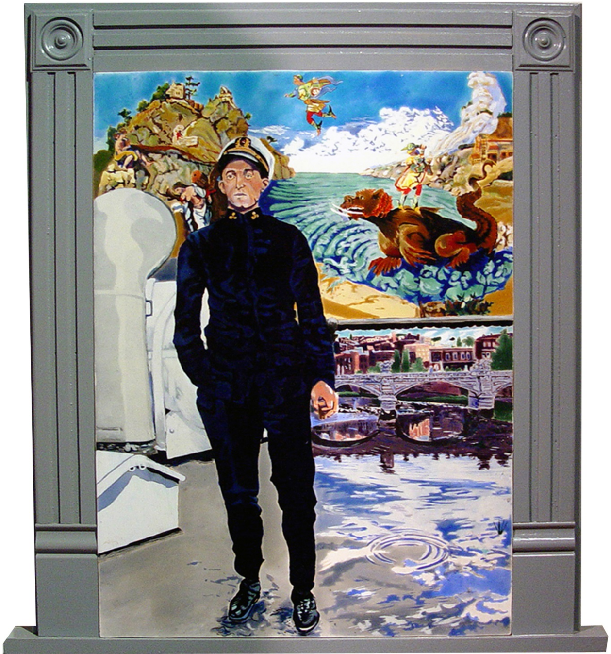
The Adventures of Great Uncle Pete egg tempera, 2007, 24 x18 inches