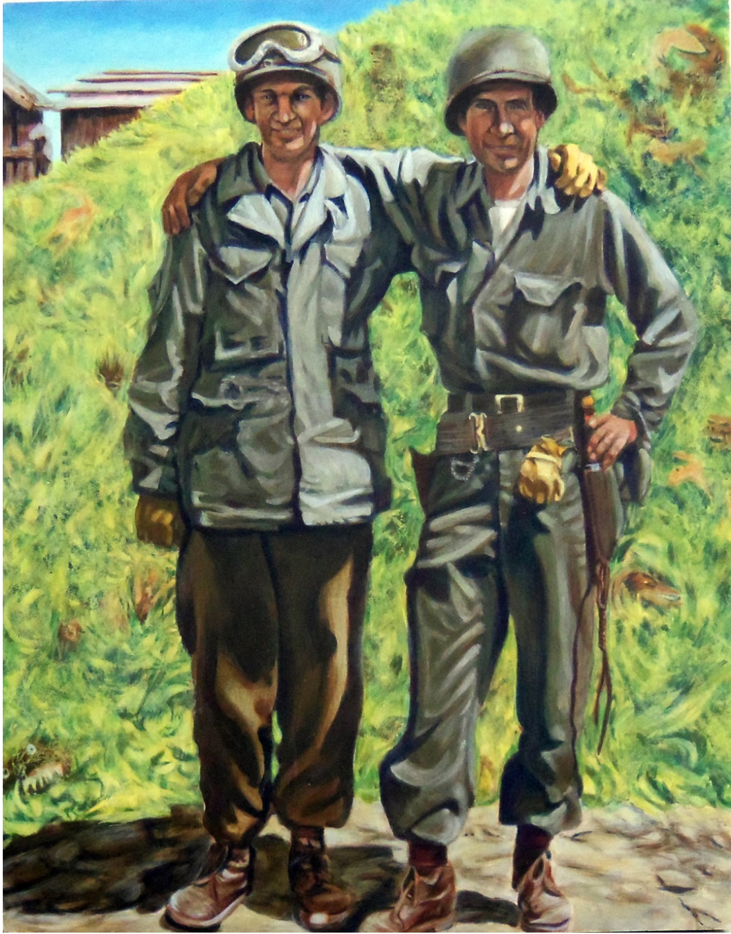
Ace and Frank egg tempera, 2013, 20 x16 inches