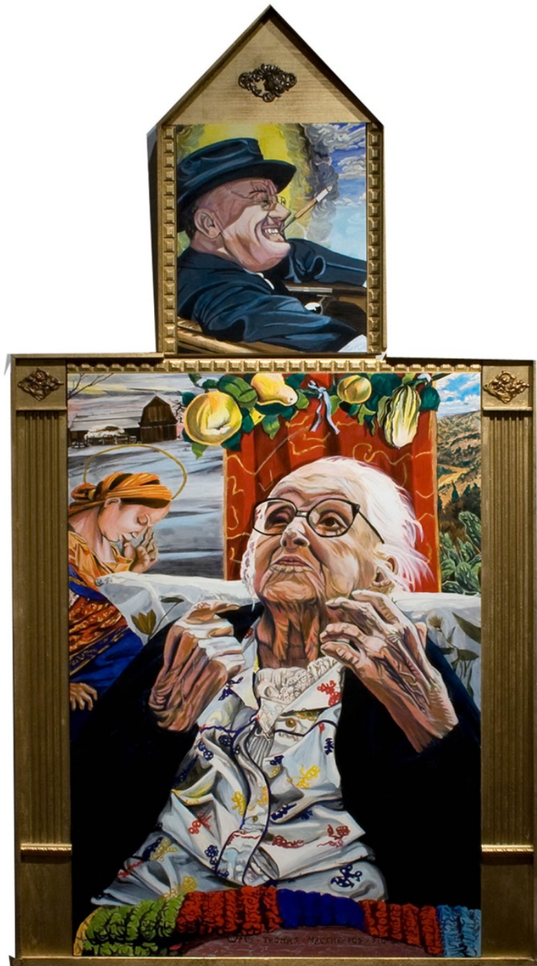
La Mia Vita

egg tempera, 2010, diptych, 36 x 24 inches and 14 x 11 inches