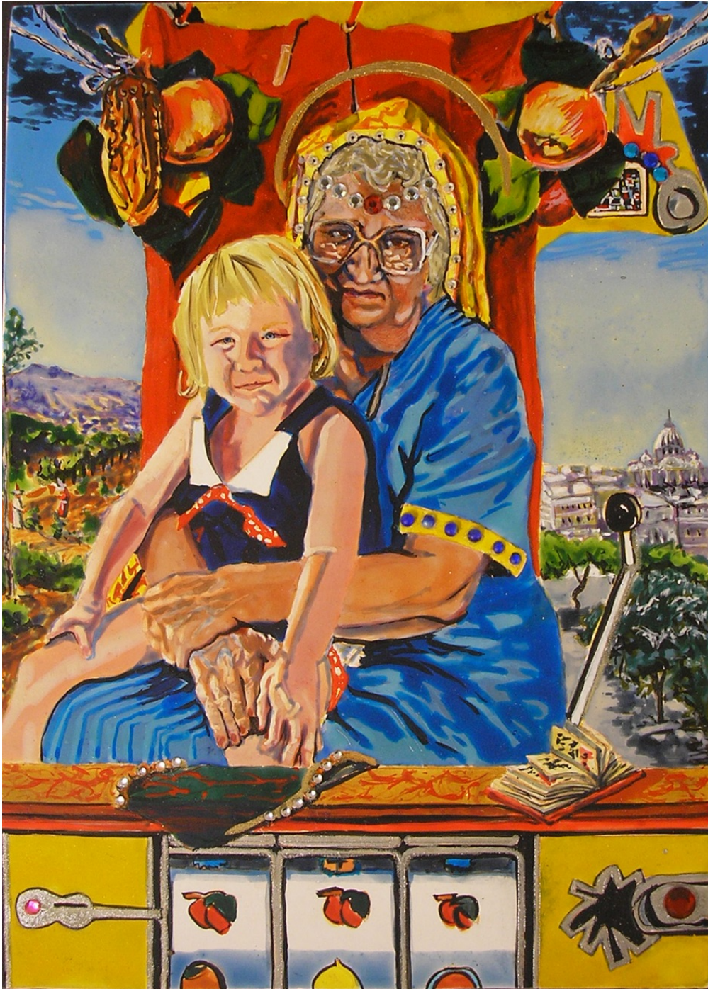
Sin City and the Holy City egg tempera, 2008, 11 x 9 inches