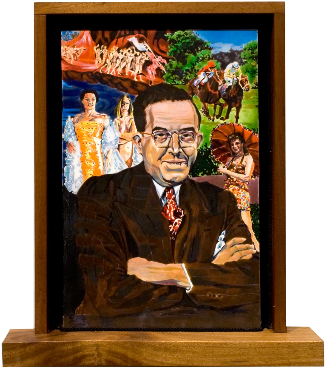
Great Uncle Tony Needs a Nurse egg tempera, 2008, 17 x11 inches