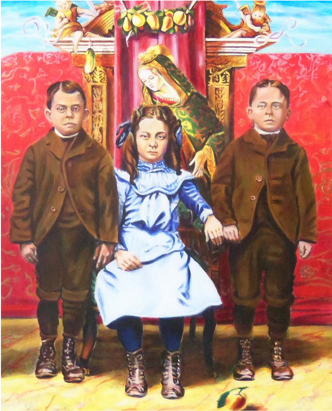
The Sacred Conversation egg tempera, 2014, 20 x16 inches