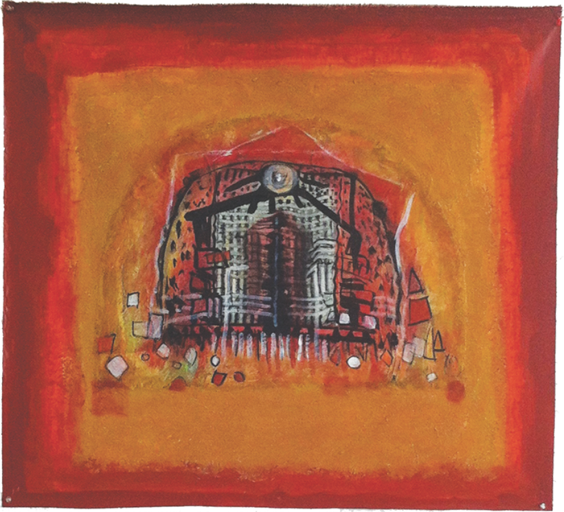
Chapels & Temples #4 , acrylic on linen, 2015, 39.5 x 33 inches