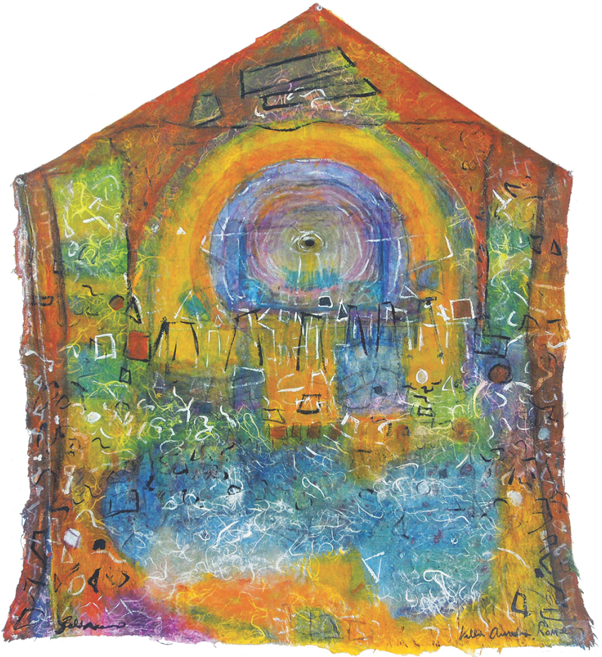
Villa Aurelia , acrylic on canvas, 2014, 34 x 30 inches