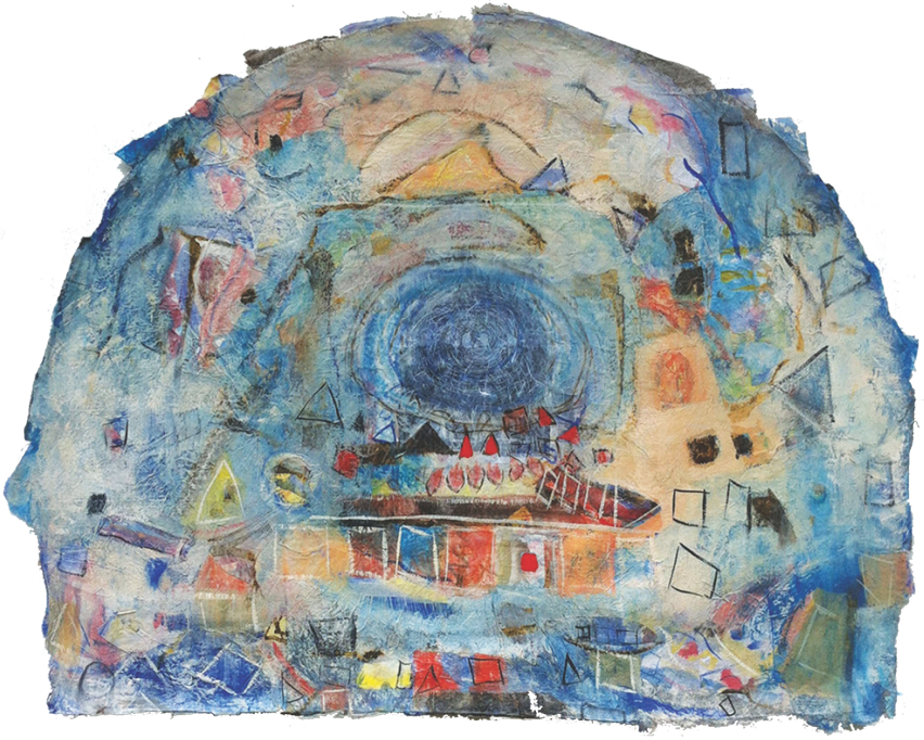
Trastevere , mixed media, 2012, 36 x 46 x 1 inches