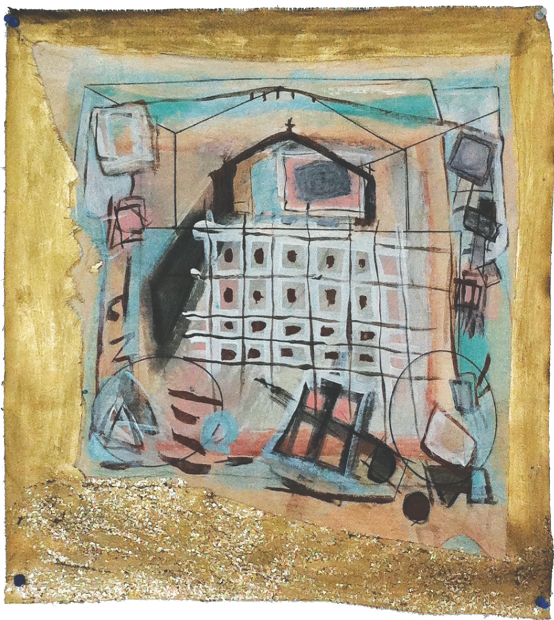
Chapels & Temples #6 , acrylic on linen, 2015, 21 x 18.5 inches