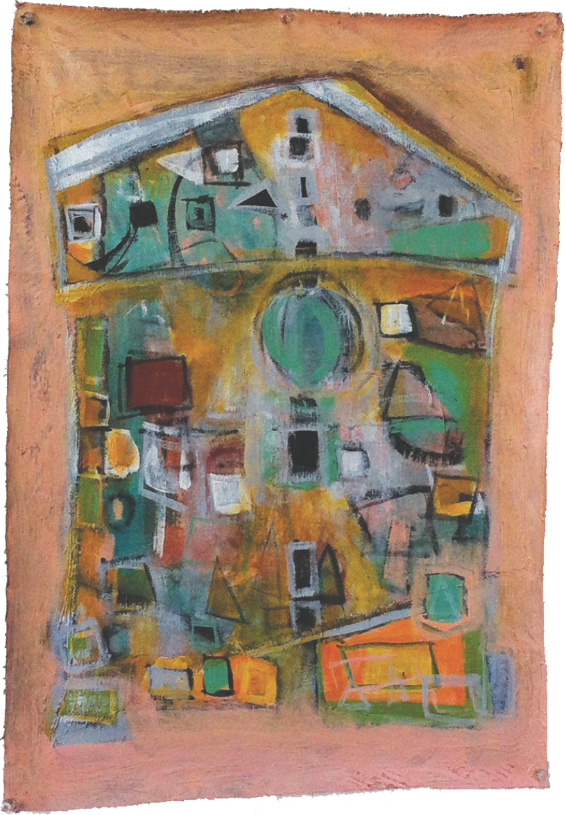
Chapels & Temples #8, acrylic on linen, 2015, 22 x 15.5 inches