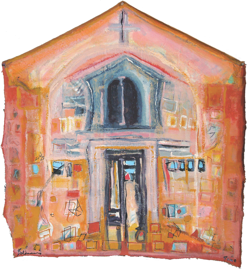
Via Appia , acrylic on canvas, 2014, 32 x 30 inches