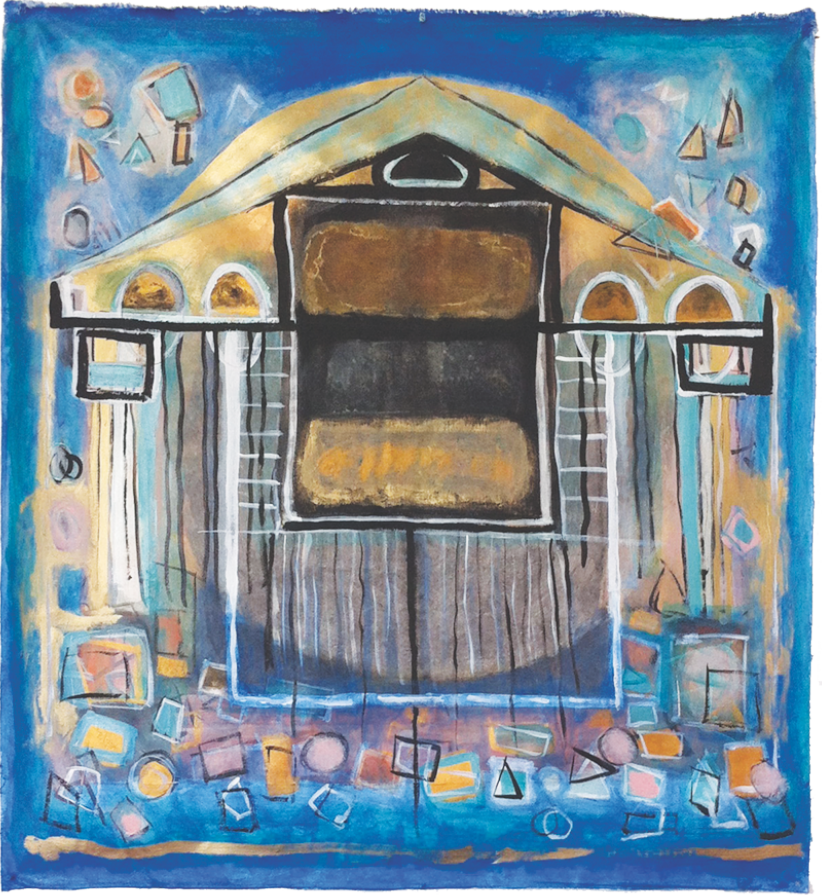
Pantheon #1 , acrylic on linen, 2015, 43 x 40 inches