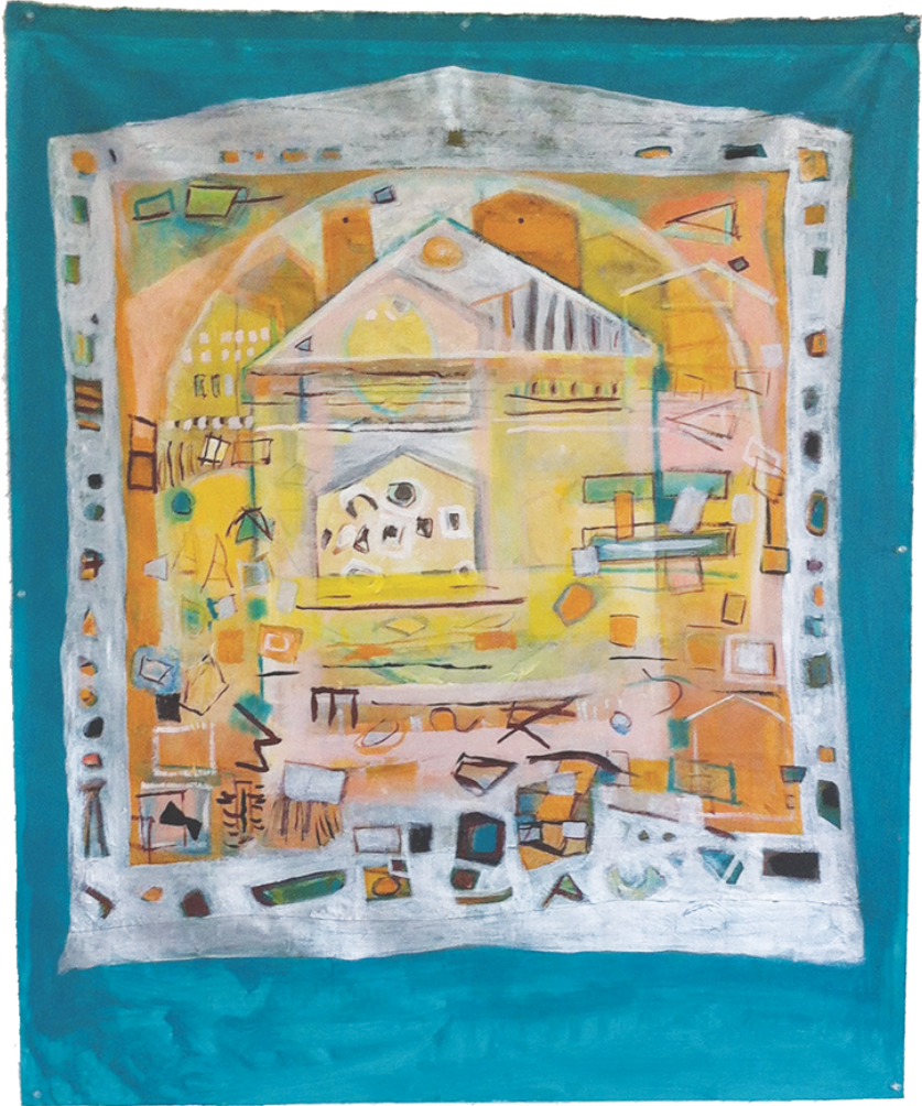
Chapels & Temples #2 , acrylic on linen, 2015, 44 x 36.5 inches