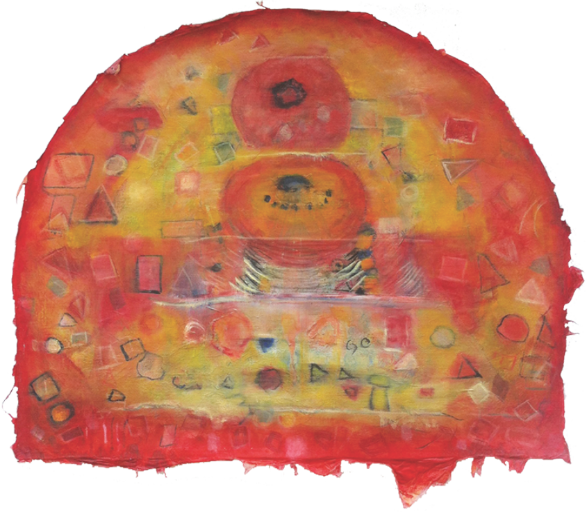
Bracciano , mixed media, 2012, 36 x 46 inches