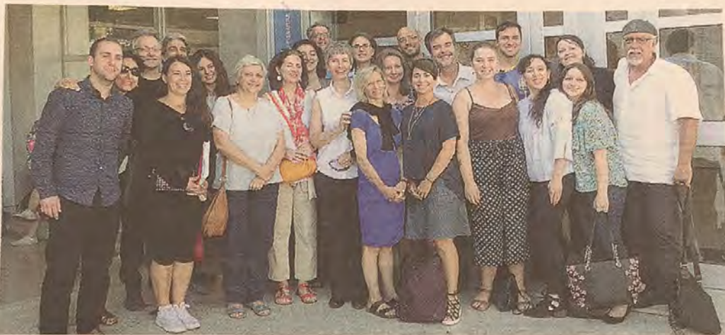
Seminario Il gruppo di studiosi che si è riunito nelle aule della Scuola di Lettere, Filosofia e Lingue