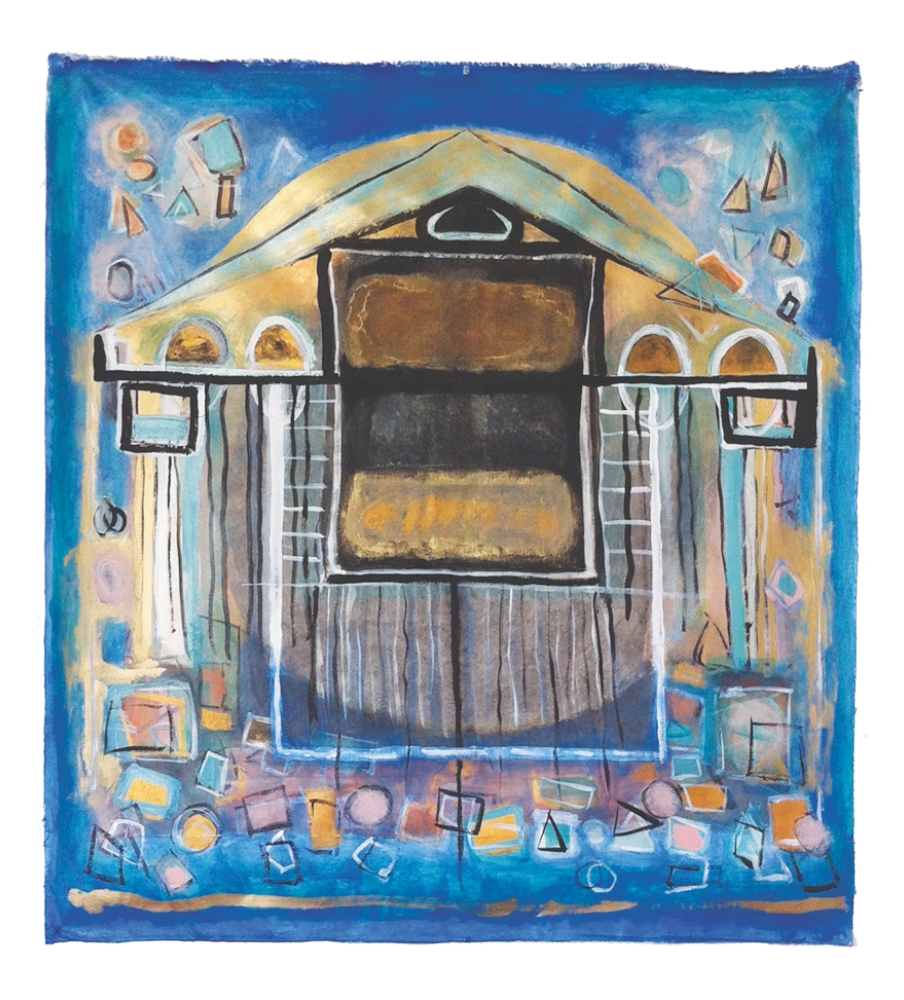
Pantheon #1, acrylic on linen, 2015, 43 x 40 inches