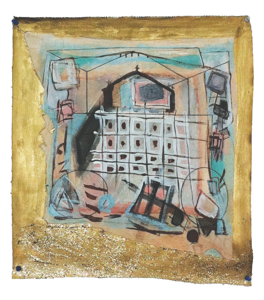
Chapels & Temples #6, acrylic on linen, 2015, 21 x 18.5 inches