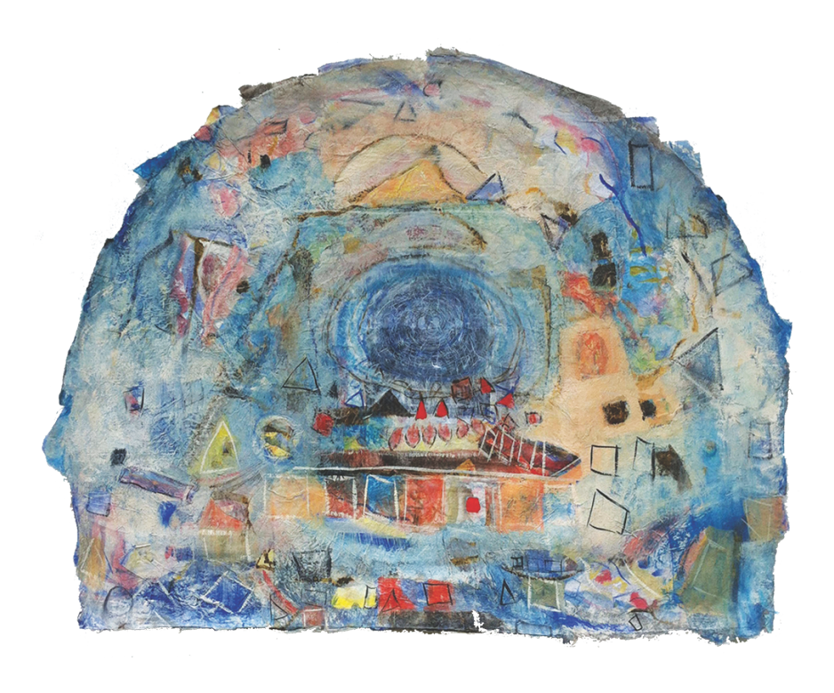
Trastevere , mixed media, 2012, 36 x 46 x 1 inches