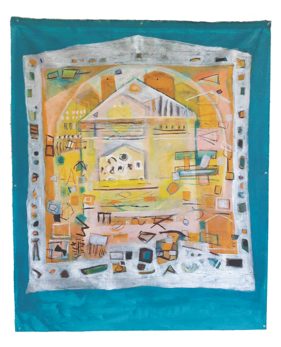
Chapels & Temples #2, acrylic on linen, 2015, 44 x 36.5 inches