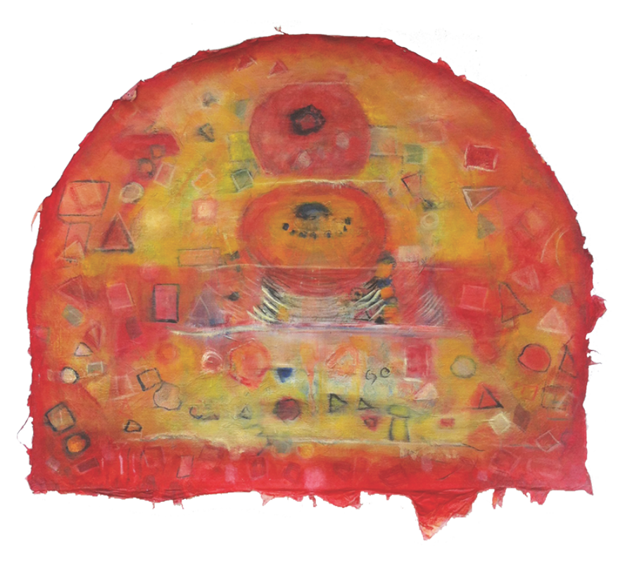
Bracciano , mixed media, 2012, 36 x 46 inches