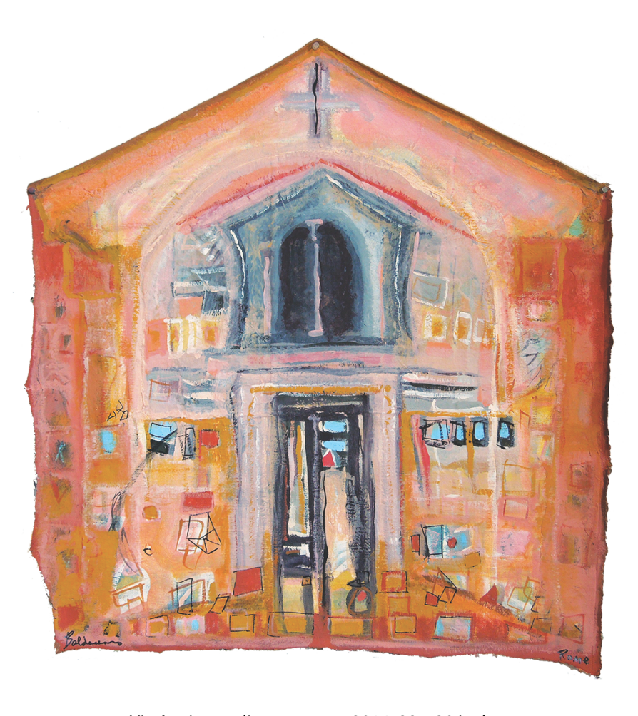
Via Appia, acrylic on canvas, 2014, 32 x 30 inches