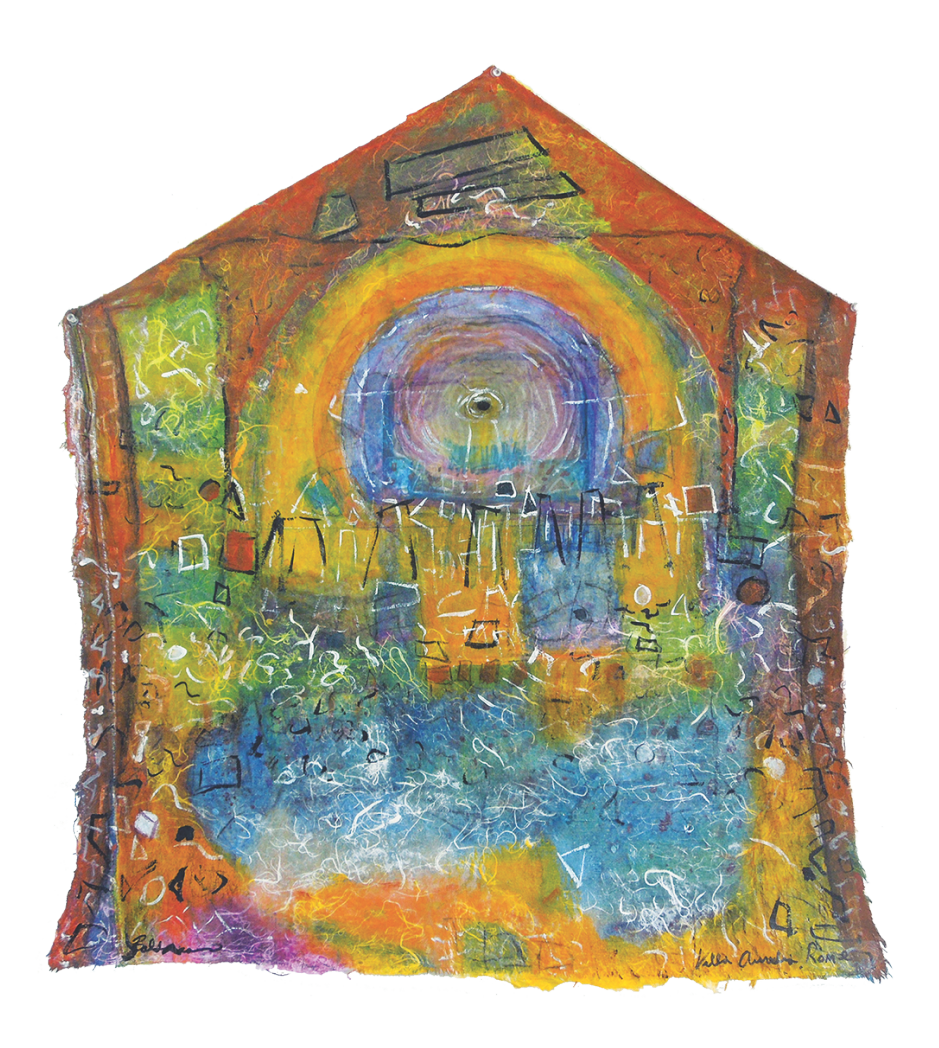
Villa Aurelia, acrylic on canvas, 2014, 34 x 30 inches