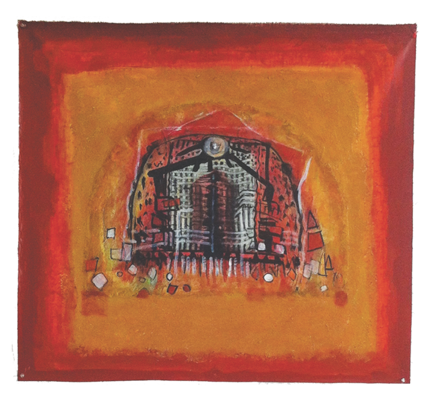
Chapels & Temples #4, acrylic on linen, 2015, 39.5 x 33 inches