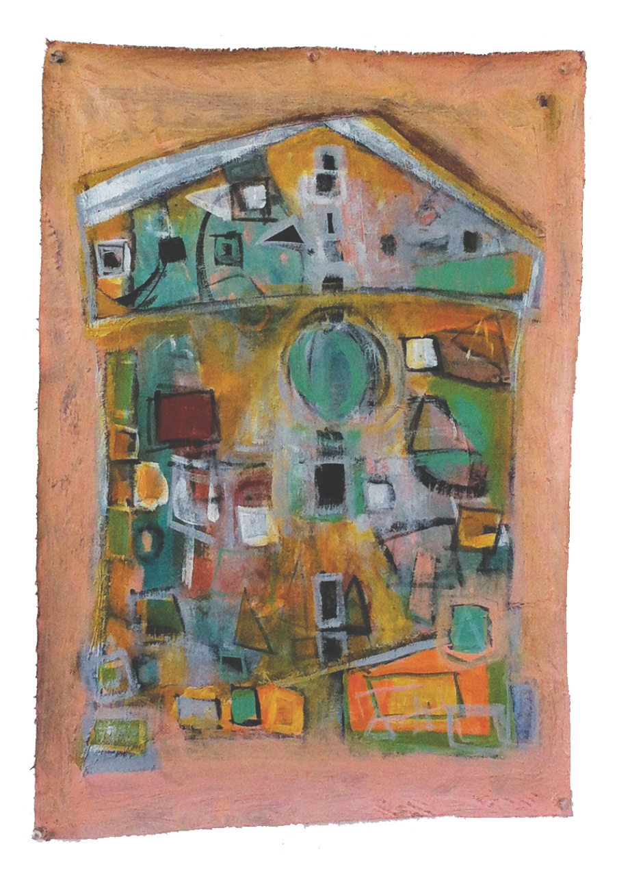
Chapels & Temples #8, acrylic on linen, 2015, 22 x 15.5 inches