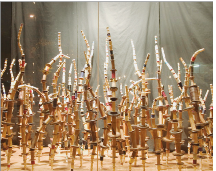
Antique wooden mill and serving thread spools, velveteen, aluminum rods, wood base.