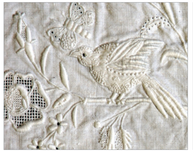
Pillow sham with garden imagery. Messina, Sicily, c. 1900.