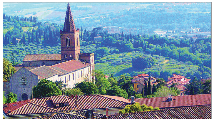
Perugia is the capital city of Umbria in central Italy, a region known as the "green heart" of Italy.