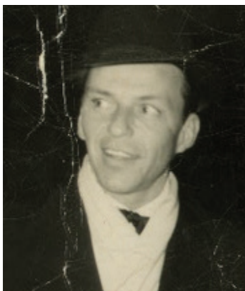
"Frank Sinatra"

Highlights from recent Italics broadcasts include: