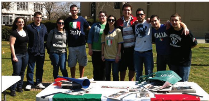
The Italian American Club of Queens College celebrates Italian Heritage and Culture Month on the campus quadrangle.