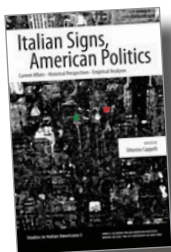
Italian Signs, American Politics: Current Affairs, Historical Perspectives, Empirical Analyses EDITED BY OTTORINO CAPELLI Studies in Italian Americana, Volume 5