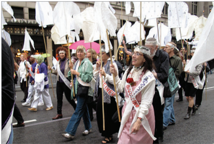
Coalition participants march with shirtwaists on poles in the 2010 Labor Day Parade.

March 25, 2011, is the 100th anniversary of the Triangle Shirtwaist Factory fire. The infamous fire claimed the lives of 146 garment workers, mostly young Italian and Jewish women, and called attention to the inhumane and dangerous conditions that immigrants typically endured as they toiled in the garment industry. In the aftermath of the fire, workers and others who shared their concerns joined together to demand better treatment and a safer work environment for all. Their cry for justice spawned a host of safety measures and galvanized the movement for social and labor reform.