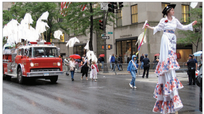
A FDNY truck carrying commemorative shirtwaists processes in the parade.

Another important aspect of building community and shared understanding involves the creation of a memory map, a community portal for collected materials related to the fire. People are talking with relatives, digging through public archives and private homes, and finding related documents and photographs that have not been in the public domain. The centennial provides a unique opportunity to collect these items and share them with the wider community.