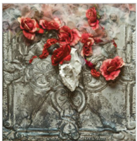
Sculpture, B Amore