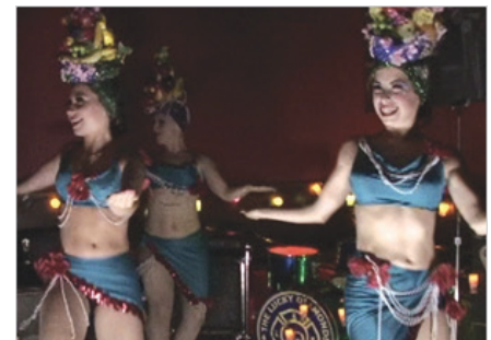
The World Famous Pontani Sisters