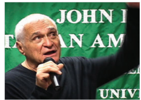
John Giorno reading from his book "Subduing Demons in America."