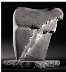
Sculpture, Richard Laurenzi

through interviews and documentary film. The ambitious collective also plans to create a U.S.–Italy exchange program with a live-work studio facility in Italy. Founder Laurenzi states that it is “critical to support the efforts of Italian-American artists and establish relationships with Italian artistic communities.” The group plans to develop a much-needed mentoring program for Italian-American art students. For more information visit http://iavanet.com/ . To learn about upcoming exhibitions visit Richard Laurenzi's blog at: www.i-italy.us .