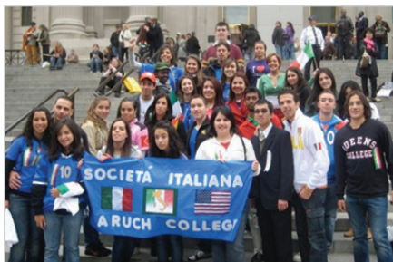
Student members of Società Italiana, Baruch College