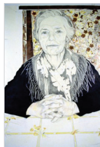
Painting, Rita Passeri