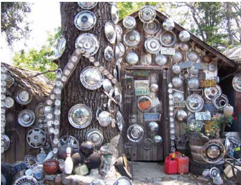
LITTO'S HUBCAP RANCH

Calandra Italian American Institute Attn: Book Orders 25 West 43rd Street, 17th floor New York, NY 10036