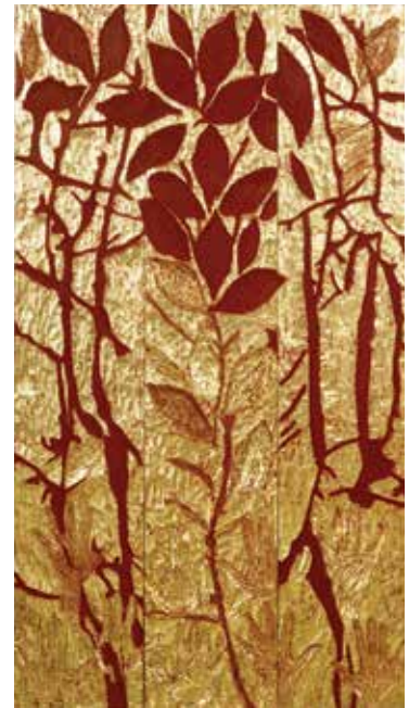
HICKORY WITH HANDS, 2004