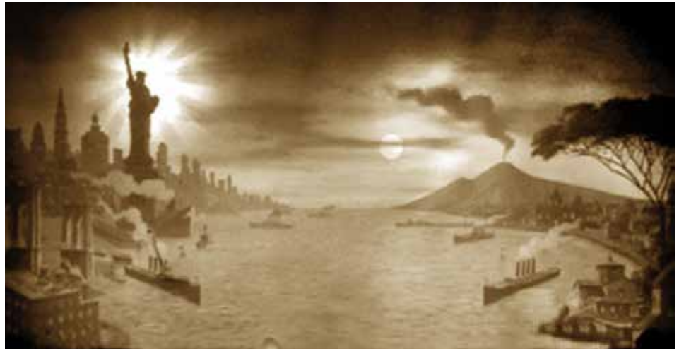
Logo for Edizione Pennino, New York City, courtesy of Simona Frasca.

The canzone napoletana has been one of the first international popular musics of the modern era, traveling beyond the city of Naples and the borders of Italy. Its success was due, to a large degree, to Italian immigrants in the New World who composed, performed, recorded, sold, and consumed the music in the forms of sheet