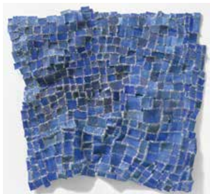
BYZANTINE HOMAGE (1), 2005 Cloth, acrylic paint, wax, thread, 35 x 35 x 3 inches